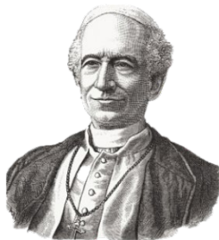
Pope Leo XIII, Founder of the Catholic University of America

It is imperative that you enter a new requisition for FY25 for any good or service that will be delivered after May 1, 2024, so that when the budget for your school or department is loaded into Cardinal Financials, it can proceed to becoming a valid purchase order for FY25.